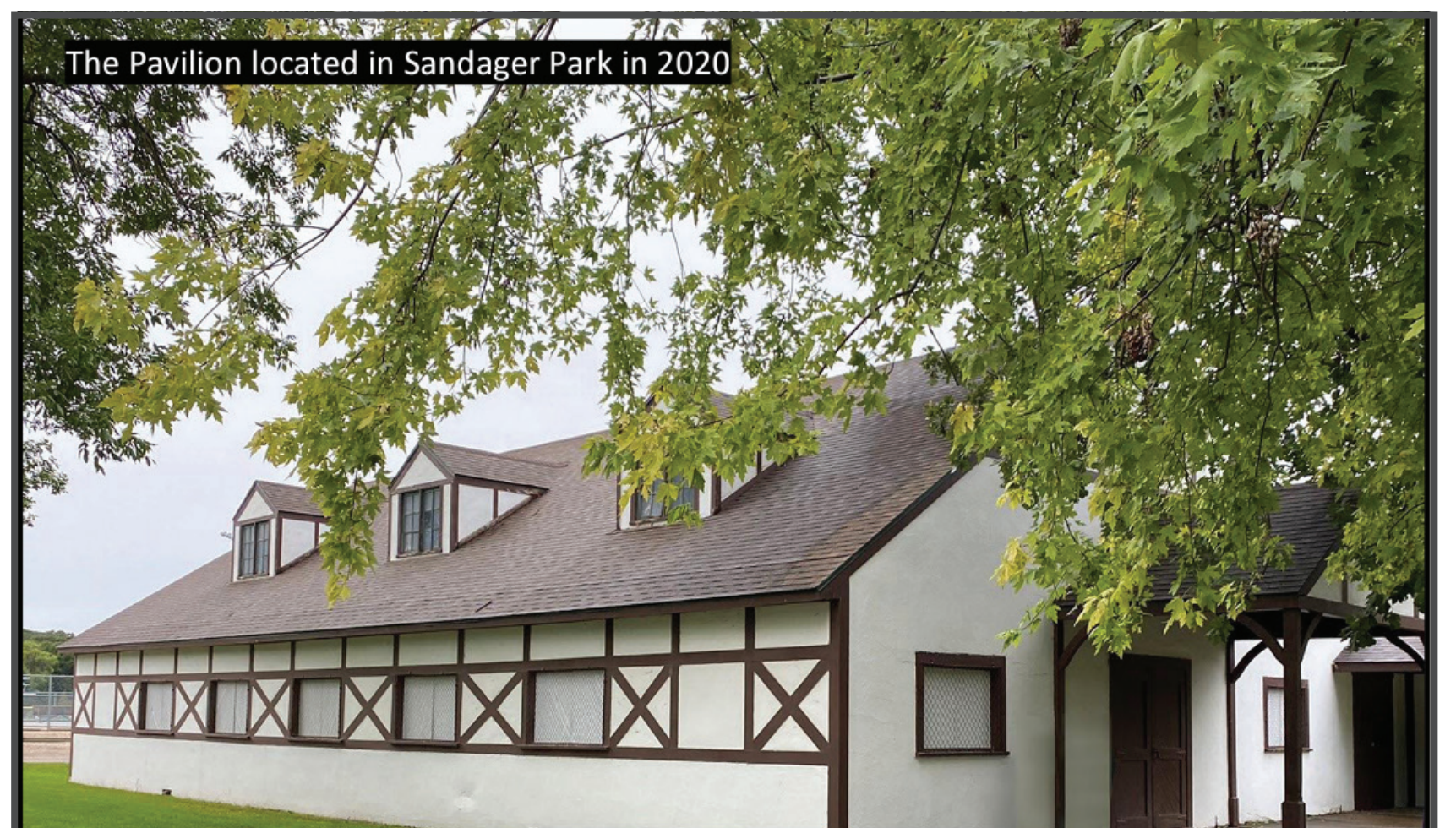
Sandager Park Pavillion, before and after.

New rock and tables were also part of the renovation.