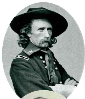
Lt. Colonel Custer