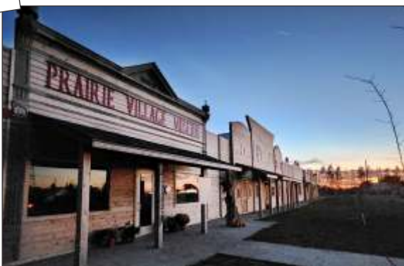
learning about the old days...while makin' new friends!