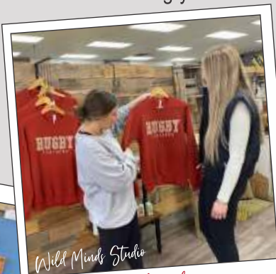
Shop til ya drop

Don't miss all the unique stores showcasing a shopping experience you will not forget!