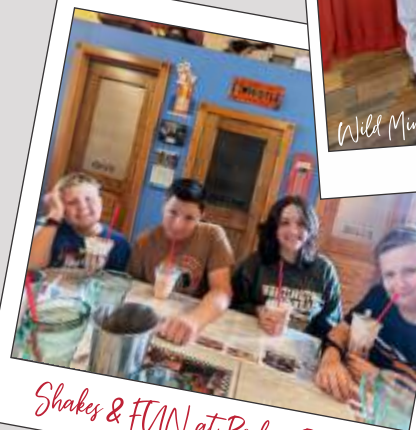
Shakes & FUN at Rockin' Relics!