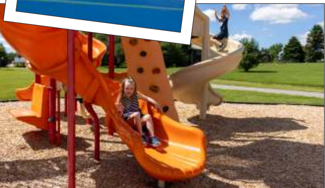
Splash pad coming Summer of 2025