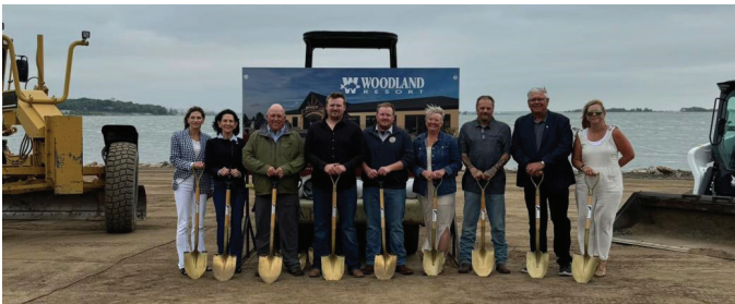
The Shores Event Center at Woodland Resort, Devils Lake - The Shores will feature panoramic views of Devils Lake, state of the art sound and lighting, outdoor patio and bar/catering on-site. The space can hold 400 people.