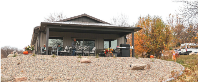
Good Bear Bay Lodge at Indian Hills Resort - The lodge sits on the shores of Lake Sakakawea, and offers a 4-bedroom, 2.5-bath living area for families or larger groups. It also has a full kitchen, living area, and an extended covered outdoor patio.

Tourism destination development has the potential for economic and sociocultural effects that will positively impact further growth in our state. As our state continues to lead innovation in several economic development sectors, it is important to create a better quality of life for our residents by connecting resources to drive economic growth. In addition, we recognize the importance of developing unique tourism experiences that share our story with non-residents to increase tourism revenue and to bring awareness of North Dakota, which supports workforce talent recruitment to the state.