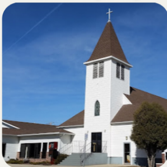
GRACE LUTHERAN CHURCH (ELCA)