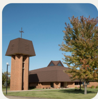
ST. CHARLES BORROMEO CATHOLIC CHURCH