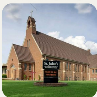
ST. JOHN'S LUTHERAN CHURCH (LCMS)