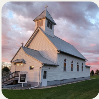
OUR SAVIOR'S LUTHERAN CHURCH