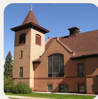
OAKES METHODIST CHURCH