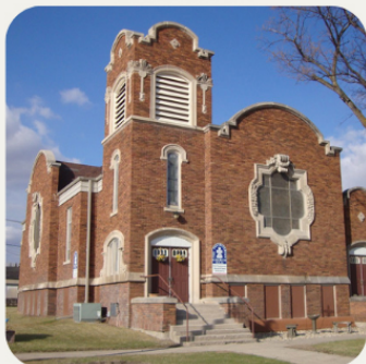
FIRST PRESBYTERIAN CHURCH