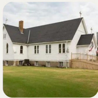
SOUTHEAST BAPTIST CHURCH