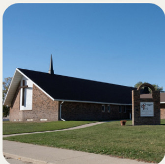
CHURCH OF THE NAZARENE