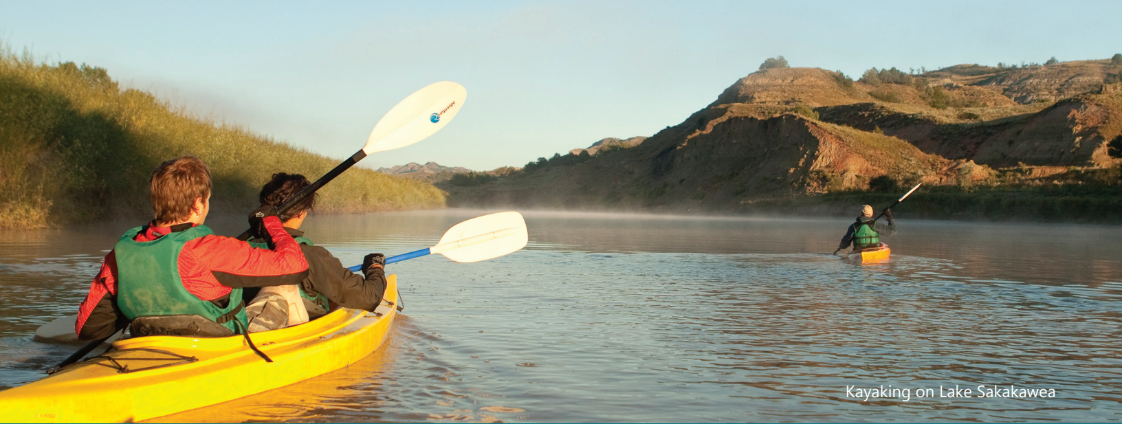
Kayaking on Lake Sakakawea