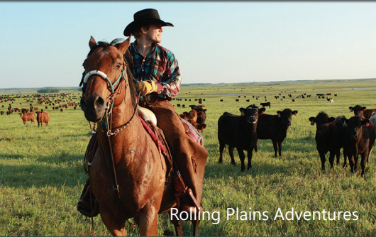
Rolling Plains Adventures