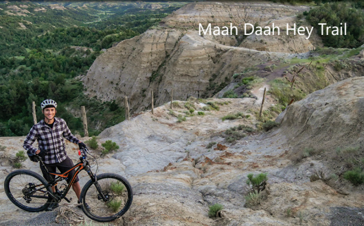
Maah Daah Hey Trail

North Dakota invites you to Be Legendary and discover your adventurous spirit. Come and explore the waterways traveled by early fur traders, steamboats and the Lewis & Clark Expedition while enjoying the wide-open prairies and scenic river valleys that were the hunting grounds, farms and villages of the Native Americans of the Northern Plains. Follow well-traveled trails once taken by western legends like Custer, Sitting Bull and Theodore Roosevelt or take it all in from a modern perspective on an ATV or paddleboard. Any way you choose to experience it, your North Dakota adventure awaits.