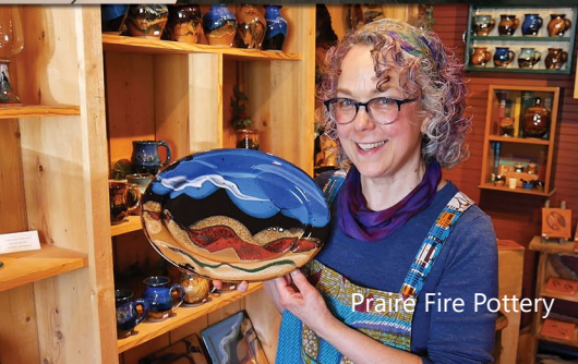
Prairie Fire Pottery

North Dakota doesn't lack for artisans, exhibits, festivals, galleries and concerts. Craft your own creation at one of North Dakota's arts and entertainment venues. Check out our plays, galleries, special events, festivals and interpretive centers. See artisans at work on an art and wine walk, watch the process of pottery making or get involved in the new Makers Movement. Art alleys and public art installations give our downtowns, large and small, a unique and vibrant flair. Art galleries around the state display fascinating and unique works, and rotating exhibits will have you going back time and time again to see what's new.