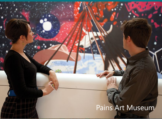
Plains Art Museum