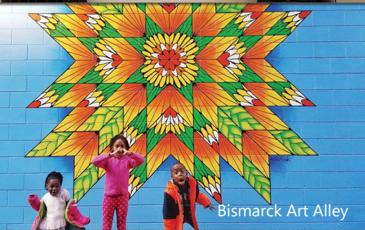
Bismarck Art Alley