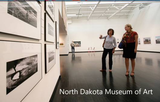
North Dakota Museum of Art