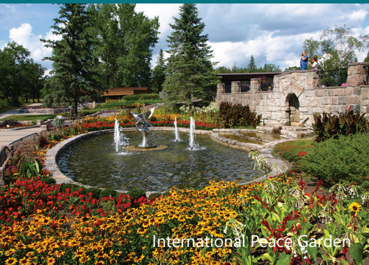
International Peace Garden