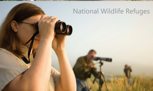
National Wildlife Refuges

From the oldest standing structures in the state to a state park defining early settlement and a mountain bike terrain park to a 2,300-acre garden dedicated to peace, Highway 5 in North Dakota offers rich cultural experiences with unforgettable recreation.