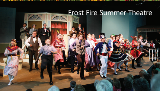
Frost Fire Summer Theatre