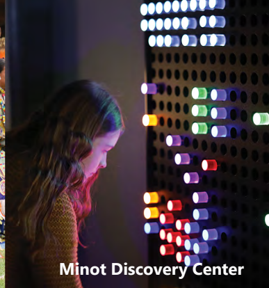
Minot Discovery Center