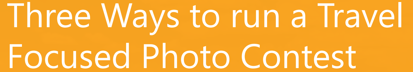
Photo contests can be tricky! Between defining goals, guaranteeing quality submissions, and maintenance, they are easier said than done. However North Dakota Tourism has run multiple successful contests that have become a consistent part of our content strategy.

So if you're interested in trying your own, here are three different ways to try out! Our list will include step by step processes, pros and cons of each and essential tips to help your contest run smoothly.