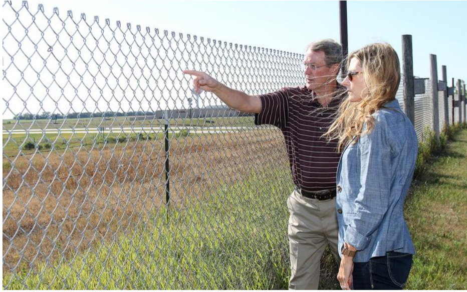
North Dakota Tourism updated on Bison World park