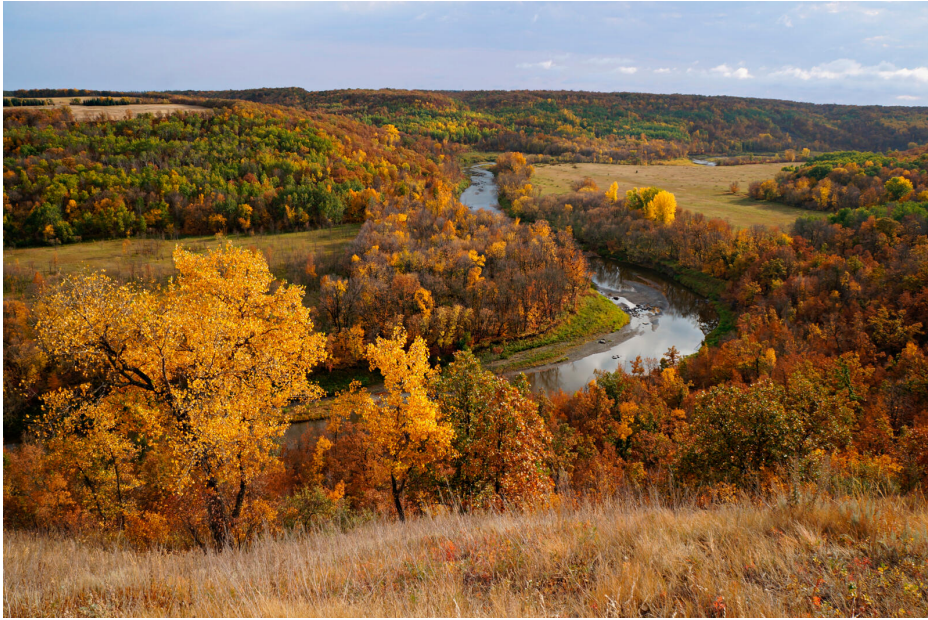
A cultural crossroads in North Dakota's Pembina Gorge