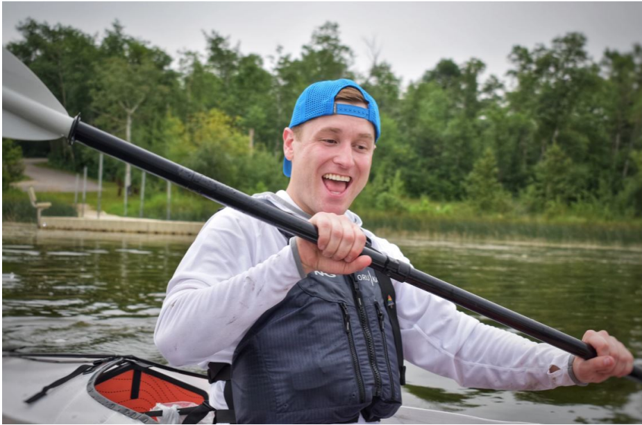
Adventures in Northern North Dakota (yes, really).