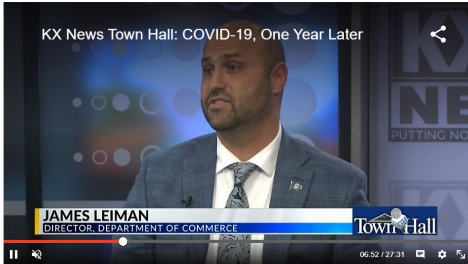
KX News Town Hall: COVID-19, one year later