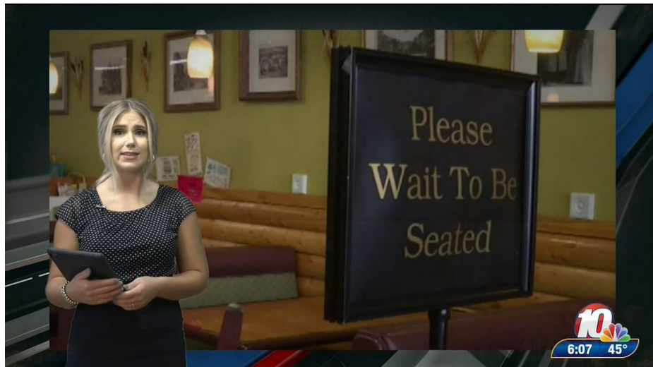
American Rescue Plan Act provides aid for hospitality businesses