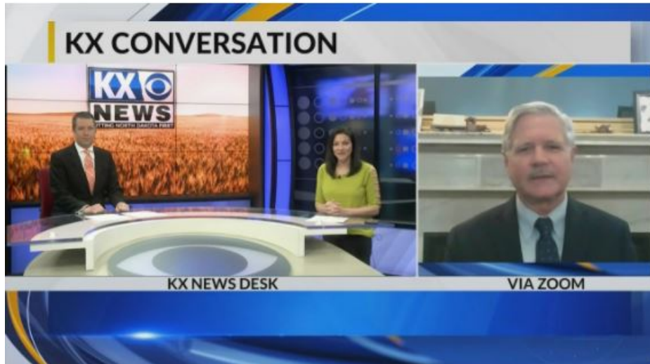
KX Conversation: Sen. John Hoeven on new soybean crushing facility coming to North Dakota