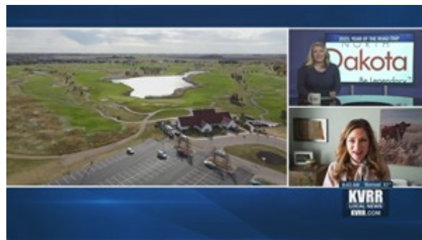
LIVE: Year of the road trip