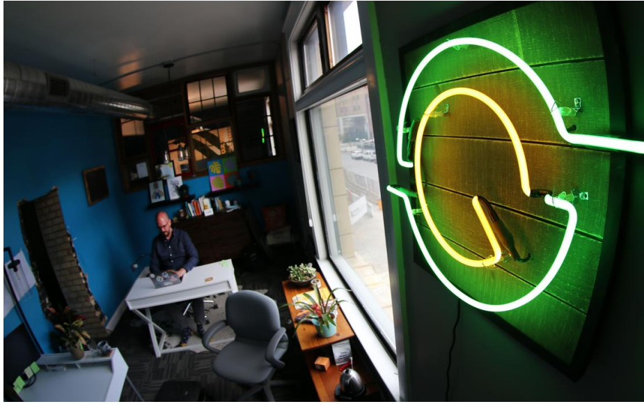
Genesis Feed Technologies helps 'rethink the real value' of Upper Midwest corn and soy.