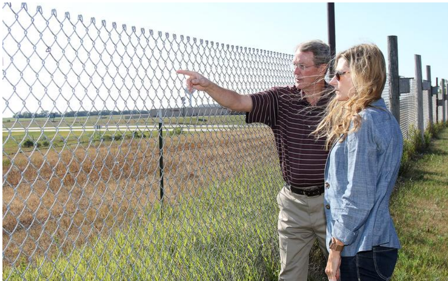
North Dakota Tourism updated on Bison World park