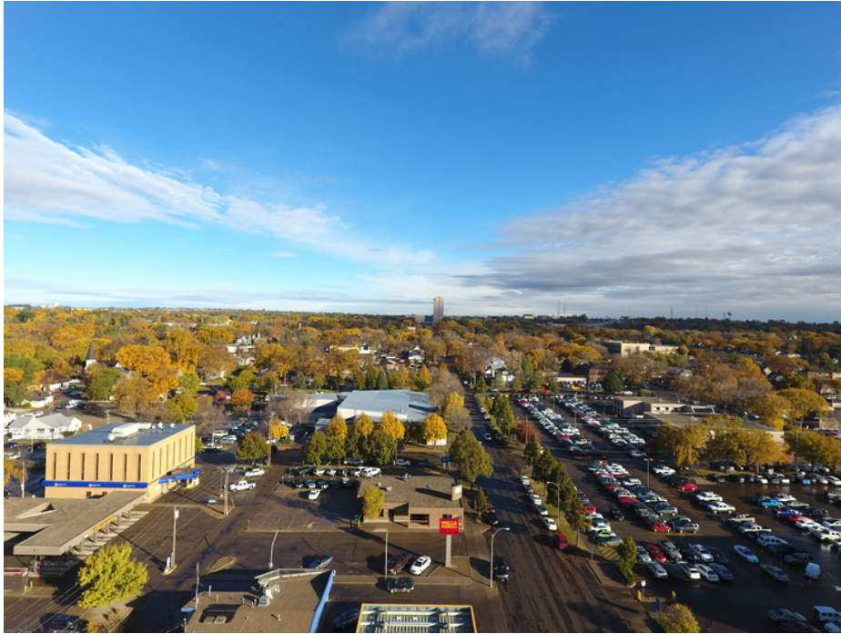
Census: North Dakota's oil counties, cities see big growth